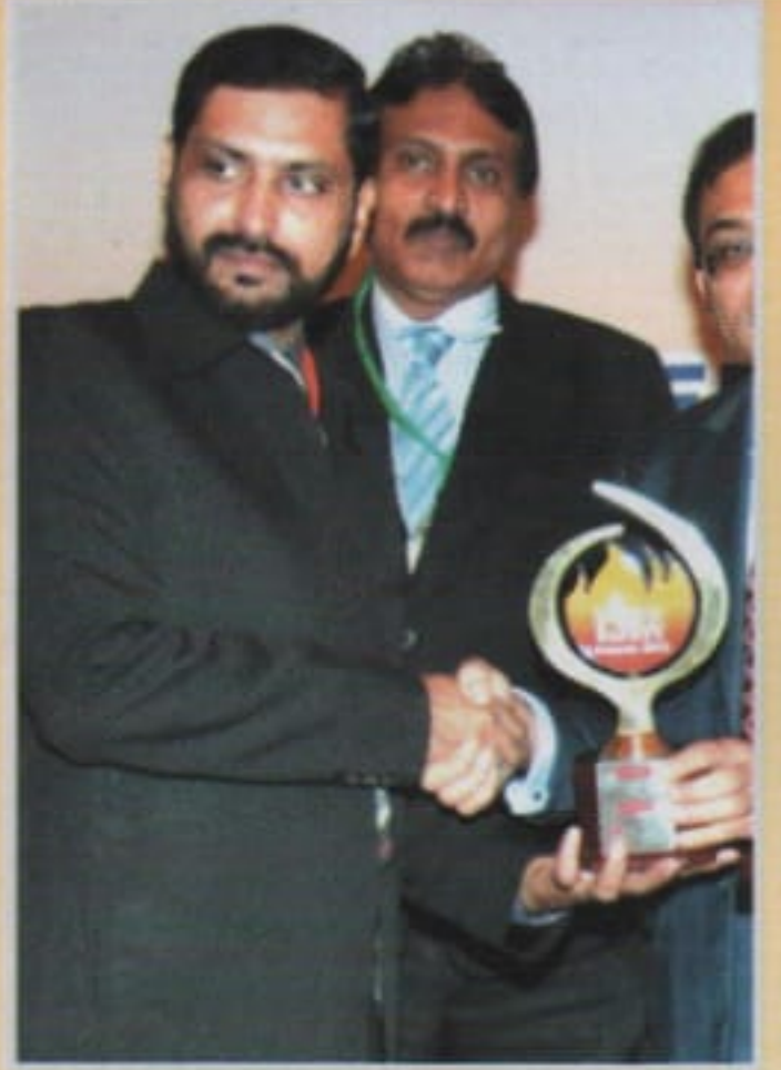
Mumtaz Muhammad Khan Yunus Textile