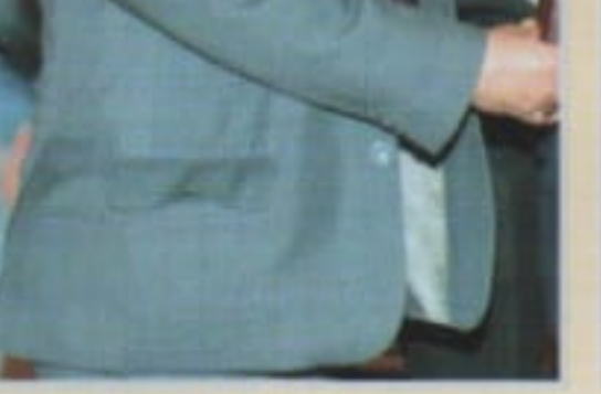
M. Ali Nizami Security Papers