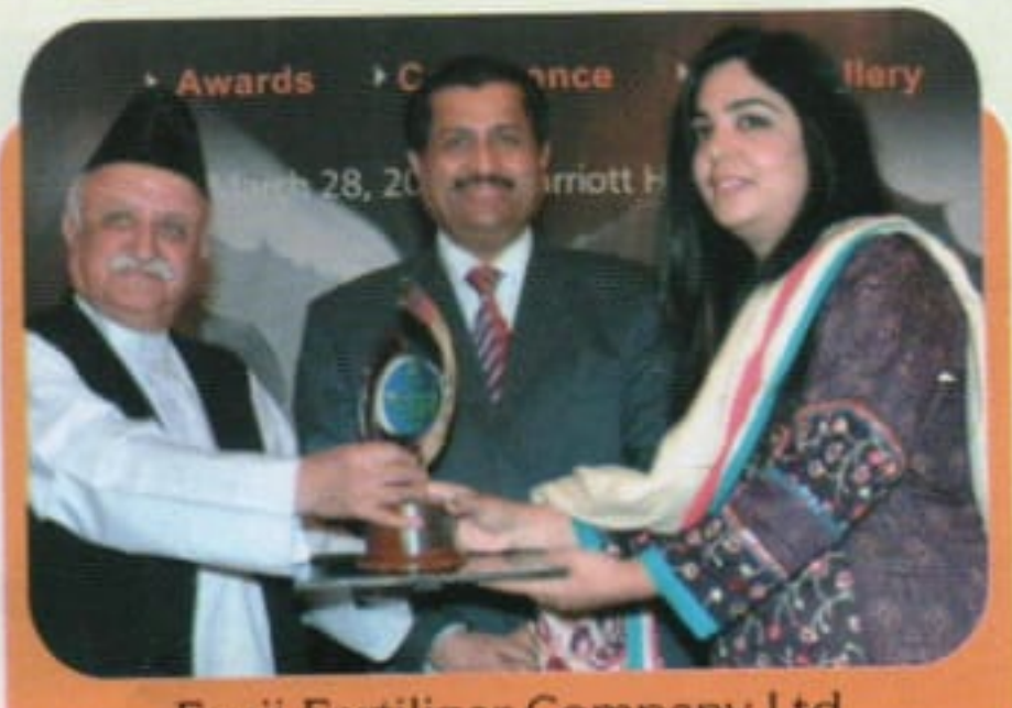
Fauji Fertilizer Company Ltd