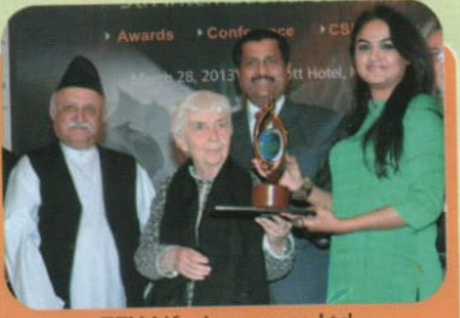
EFU Life Assurance Ltd