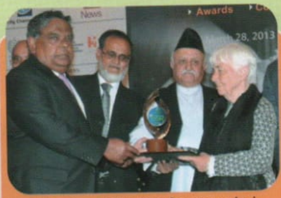
Adamjee Insurance Company Ltd