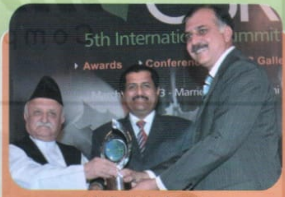
Pak Oasis Industries