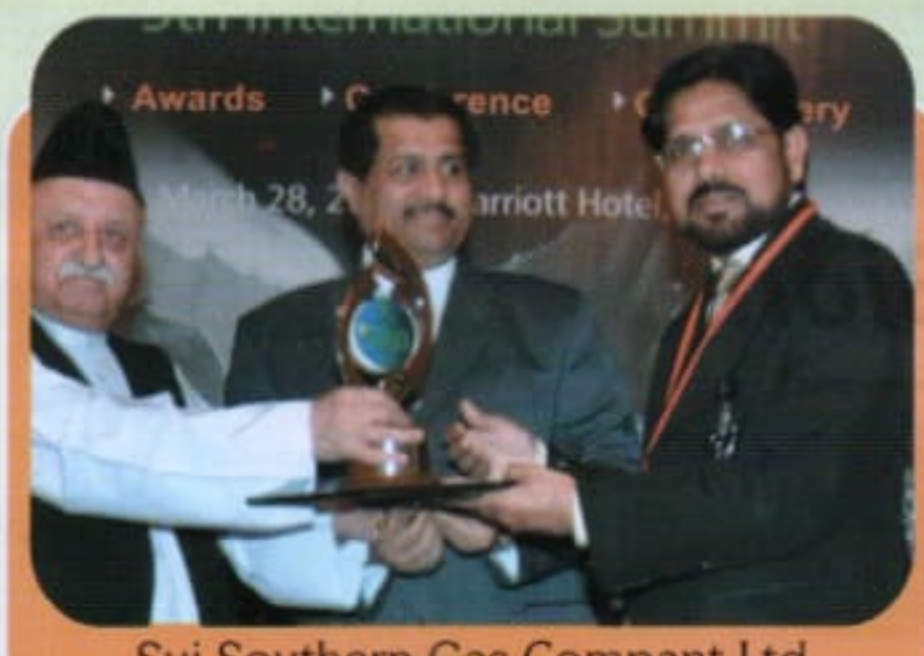
Sui Southern Gas Compant Ltd