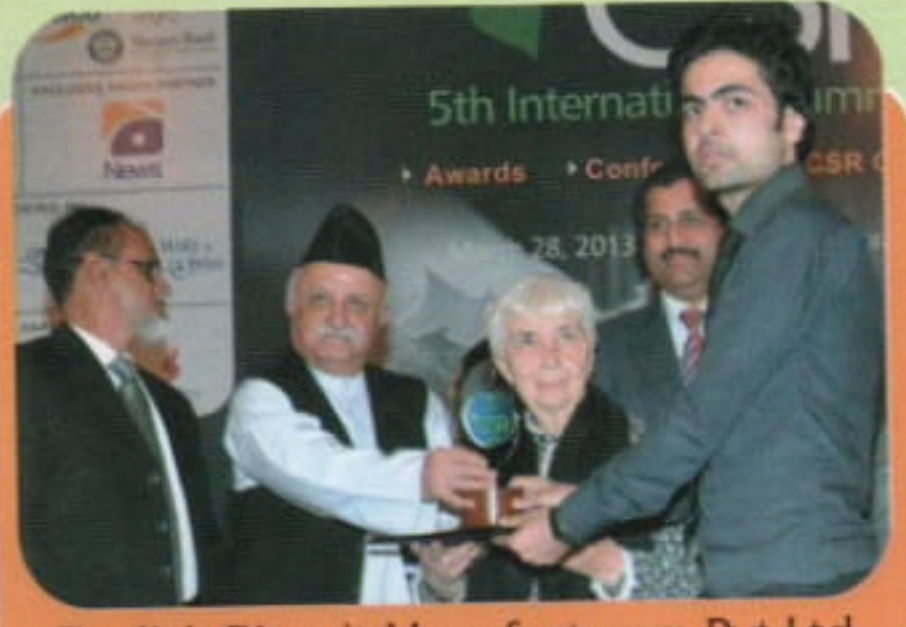
English Biscuit Manufacturers Pvt Ltd