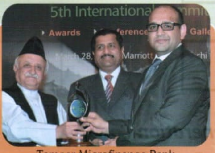
Tameer Microfinance Bank