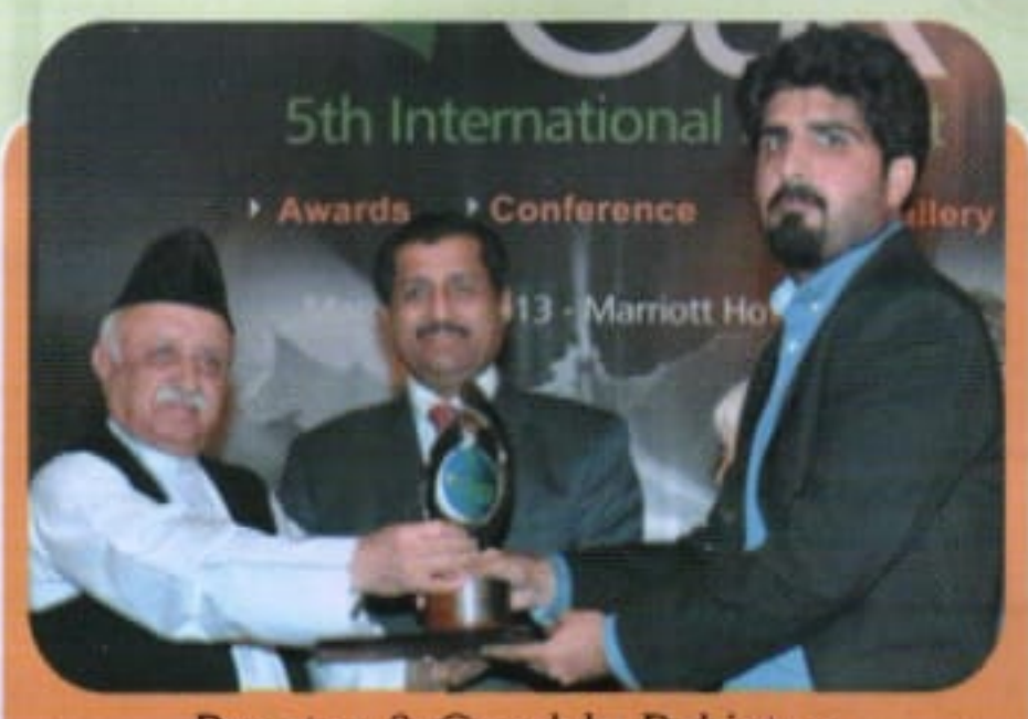
Procter & Gamble Pakistan