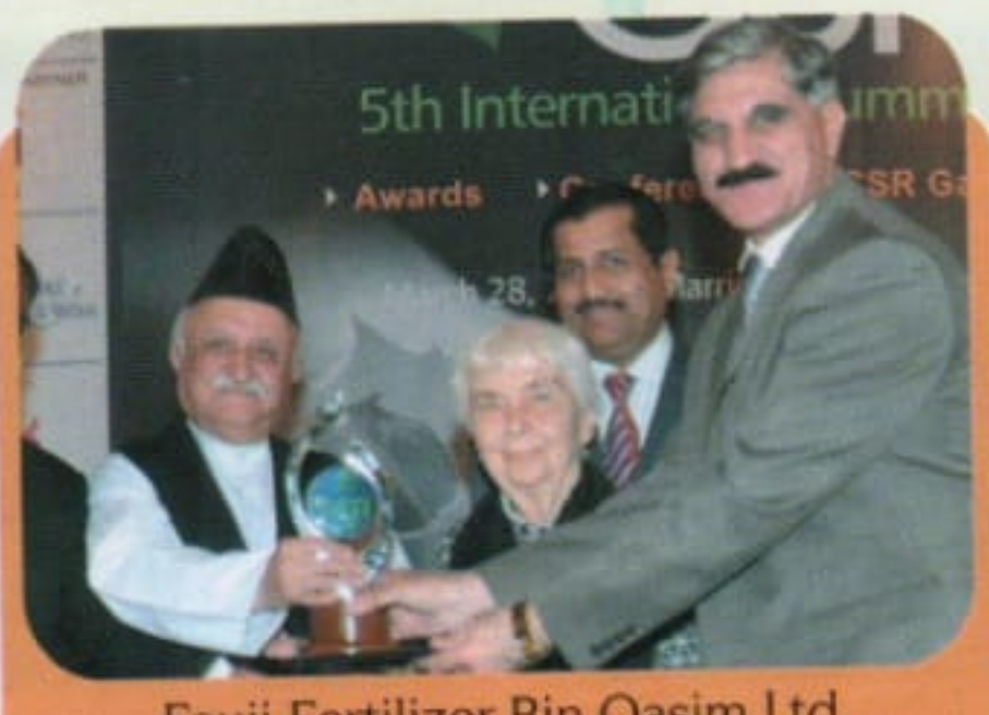
Fauji Fertilizer Bin Qasim Ltd