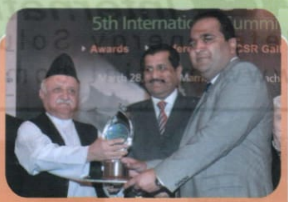
Pak Data Com Ltd