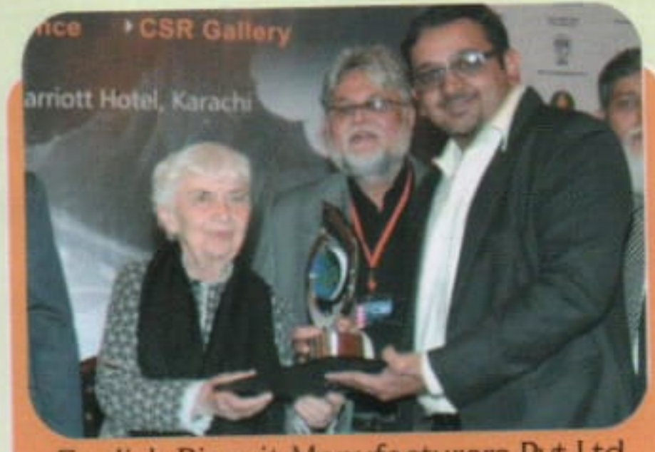
English Biscuit Manufacturers Pvt Ltd