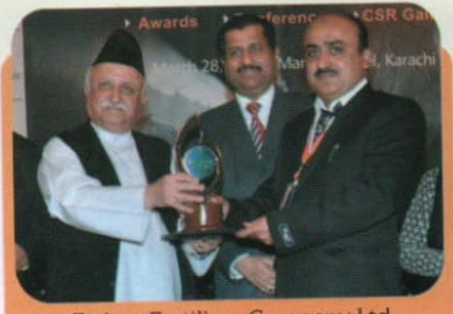
Fatima Fertilizer Company Ltd