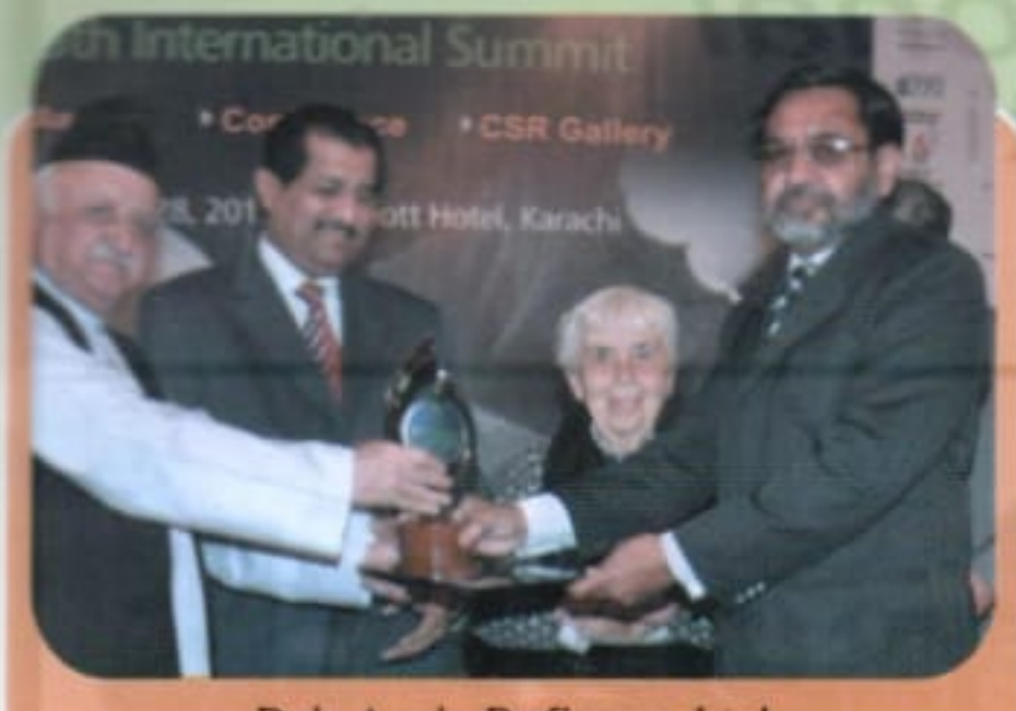
Pak Arab Refinery Ltd