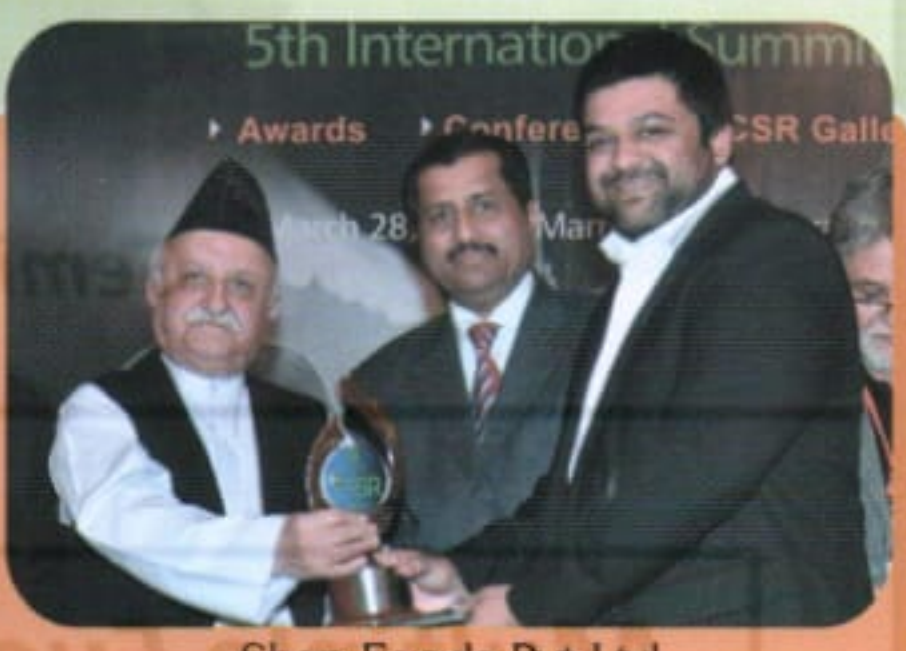
Shan Foods Pvt Ltd