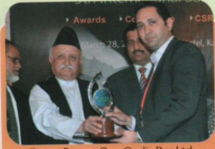
Engro Power Gen Qadir Pur Ltd