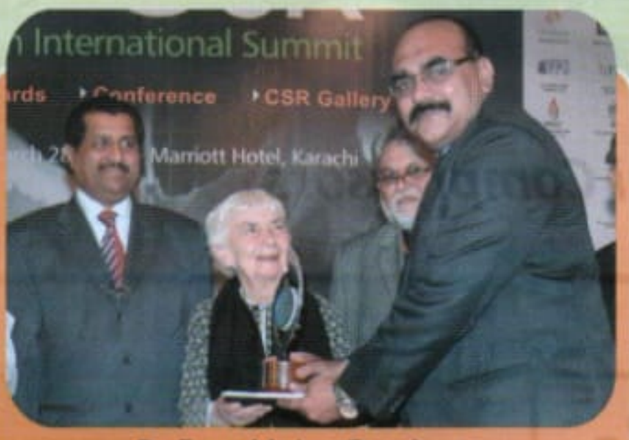
Rafhan Maize Products