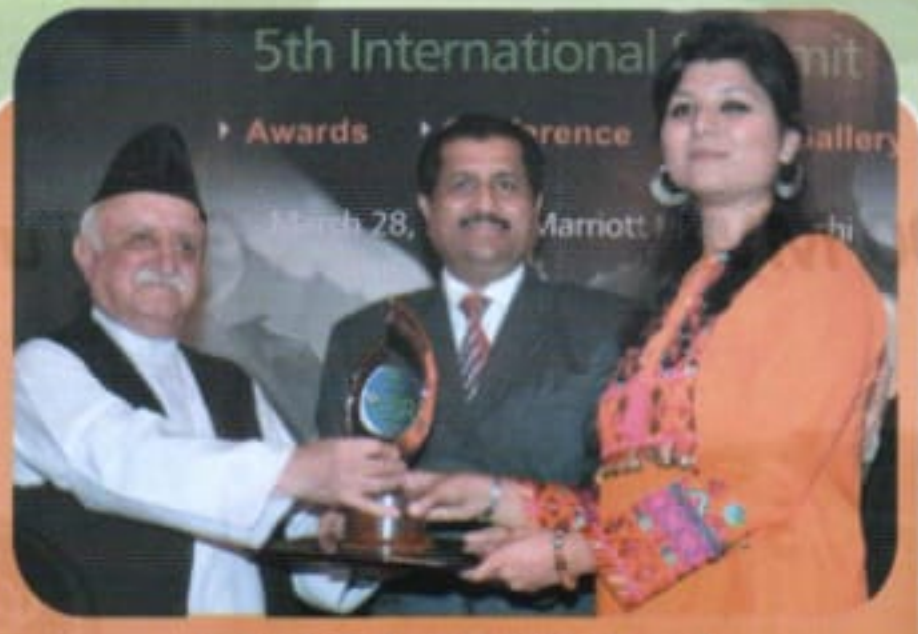
Pepsi Cola International