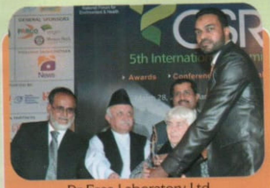
Dr Essa Laboratory Ltd