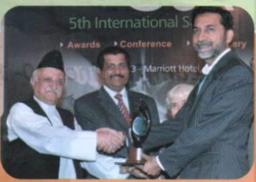
Pharmevo Pvt Ltd