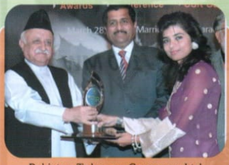
Pakistan Tobacco Company Ltd